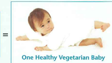
One Healthy Vegetarian Baby

Breast Milk + Appropriate Solids + Sufficient Calories