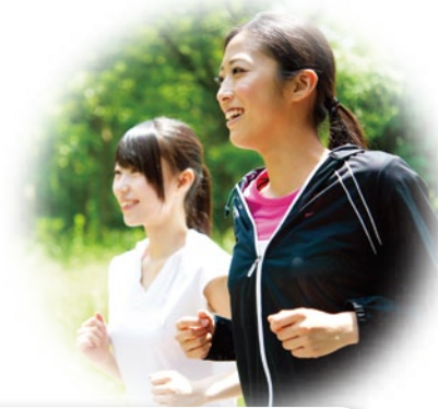
Integrative Anti-cancer Services