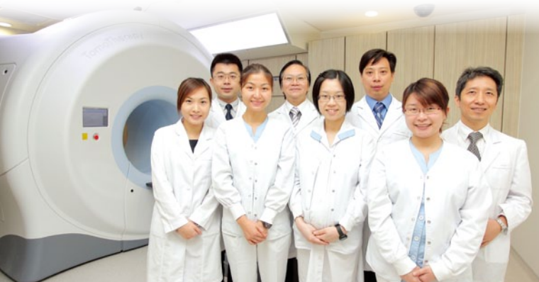
Integrative Anti-cancer Services

香港安醫院—司徒拔道一向主張提供有證可循的服務，並獲世界衛生組織授證為香港第一所健康促進醫院。