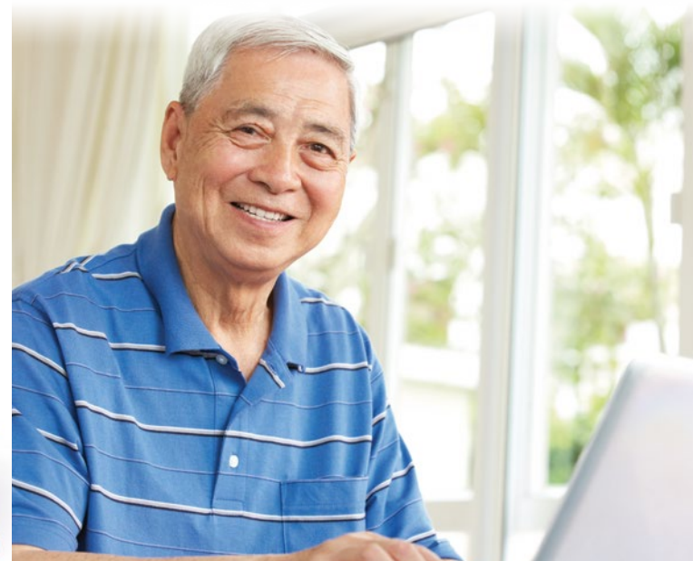
Treatment of Prostate Cancer – Robotic Prostatectomy

前列腺癌是美國和香港男性最常見的癌症之一。隨着年齡增長，尤其是55歲以上的男性，患病機會亦隨之增加。與其他癌症不同的是，前列腺癌在初期生長緩慢，不過，亦有部份進程較快的腫瘤。