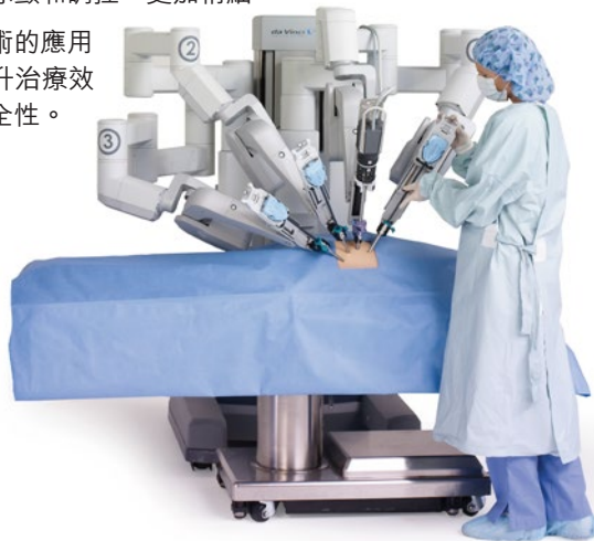
Treatment of Prostate Cancer – Robotic Prostatectomy