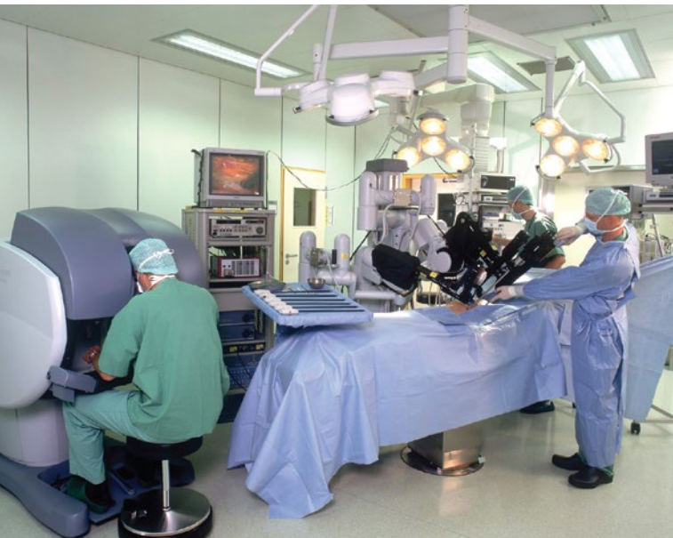
Treatment of Prostate Cancer – Robotic Prostatectomy

手術切除整個前列腺乃治療前列腺癌的方法之一，過去大多以開放方式進行，亦有少數採用微創的腹腔鏡處理。現時，許多地區已廣泛使用機械臂切除前列腺。在美國，每年使用機械臂來處理這類個案的數字，已超越傳統開放式手術。