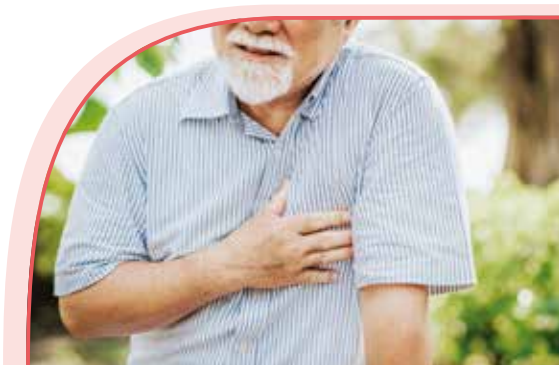
Chest Pain Clinic

心胸痛急診中心為初次出現急性心肌梗塞、心絞痛、肺栓塞等急性胸口痛患者提供全方位、快速而準確的心臟風險評估、診斷及緊急治療，即時找出病因，把握救心黃金時間。