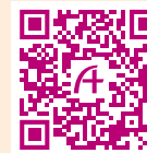
Service Information 服務詳情

40 Stubbs Road, Hong Kong 香港司徒拔道40號 (852) 2835 0651 haemo@hkah.org.hk