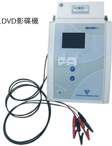
Body composition monitor 人體成份監測儀

本中心歡迎來港旅客和海外病人預約血液透析服務。本院提供不同語言的傳譯服務，並設有日語傳譯部門。