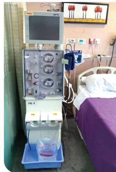
Online HDF system 線上透析過濾治療系統

HDF with online preparation of substitution fluid (online HDF) is one of the most effective dialysis modalities and combines the advantages of diffusive and convective elimination of uremic toxins, particularly for middle-size molecules. HDF shows superior clearance capability in comparison to standard hemodialysis.