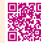
Add Download App 下載應用程式