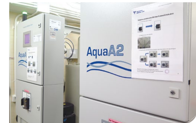
Reverse osmosis water treatment system 淨水處理系統