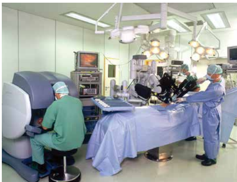
Treatment of Prostate Cancer – Robotic Prostatectomy