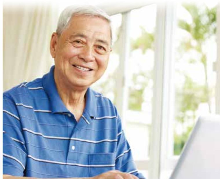
Treatment of Prostate Cancer – Robotic Prostatectomy

前列腺癌是美國和香港男性最常見的癌症之一。隨着年齡增長，尤其是55歲以上的男性，患病機會亦隨之增加。與其他癌症不同的是，前列腺癌在初期生長緩慢，不過，亦有部份進程較快的腫瘤。