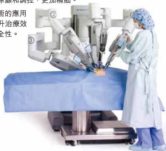
Treatment of Prostate Cancer – Robotic Prostatectomy