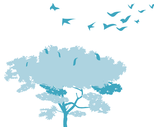
Treatment of Prostate Cancer – Robotic Prostatectomy