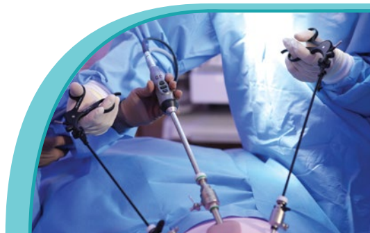
MIS Short Stay Center