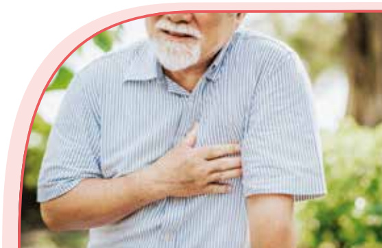
Chest Pain Clinic

心胸痛急診中心為初次出現急性心肌梗塞、心絞痛、肺栓塞等急性胸口痛患者提供全方位、快速而準確的心臟風險評估、診斷及緊急治療，即時找出病因，把握救心黃金時間。